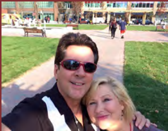
WGRR October 22

During the Grand Opening weekend festivities, Liberty Center hosted the top radio stations in the market for live remotes.