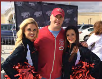
1530 ESPN October 25