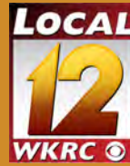
WKRC Live: 5 to 7:30 a.m.