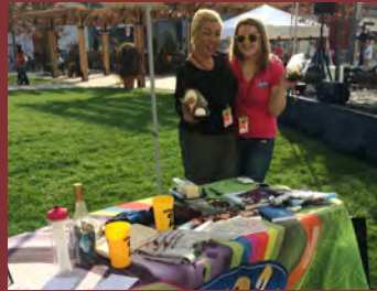
Q102 October 23