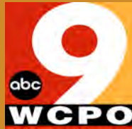
WCPO Live: 5 to 7 a.m.